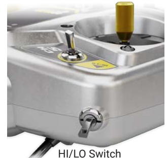
HI/LO Switch In the down position

M.Bus is a communication protocol that allows you to use one physical port on the receiver to control multiple servos. Each servo must be M.Bus capable and programmed to be on a particular digital channel.